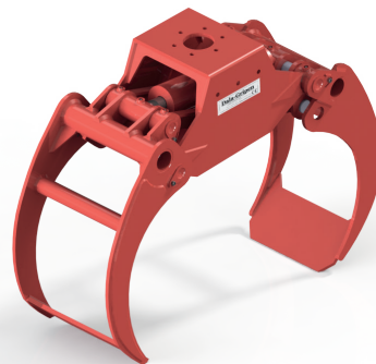
DGE 25 - 55