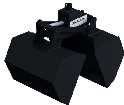
G60 L / 100 L

* Please, see the rotator connection page for detailed information.